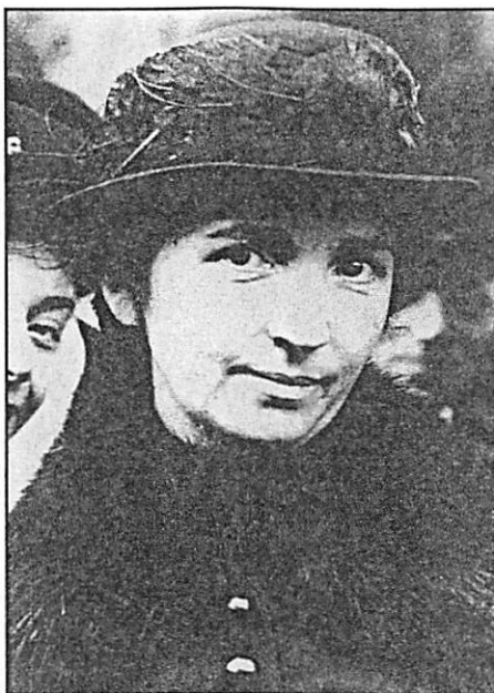
Sanger: Early eugenics revolutionary.

The abortion floodgates were flung wide open in the late 1960s after the public mind had been subjected to several decades of softening up and the organiza-